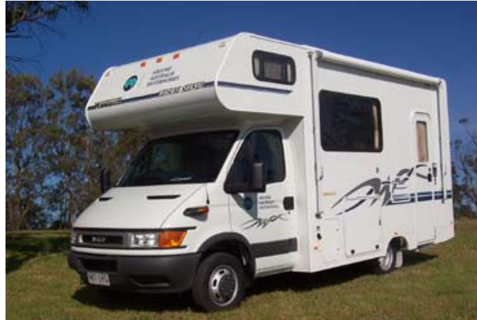
The 5 Berth Traveller . 2 to 5 people.

The Traveller has a large double bed over the cabin which can be raised allowing for easy access to the cabin. The lounge converts into a single bed and the dinette into a full size double bed making for very comfortable sleeping arrangements. This is a superb family vehicle with ample storage space and the luxuries of television and roll out shade awning.