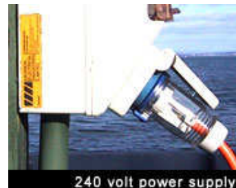
240 volt power supply